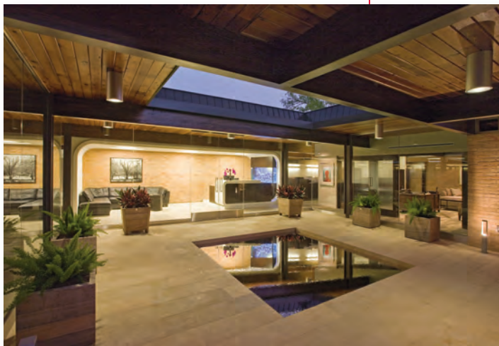
New Regional Planning