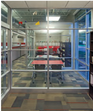
Studio RED Architects