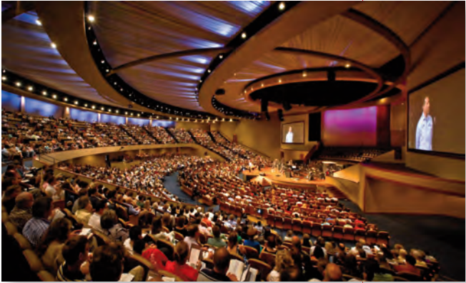
Houston's First Baptist Church