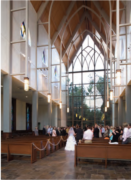
Fellowship of The Woodlands Chapel