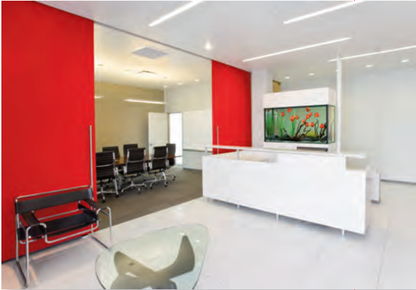
Studio RED Architects