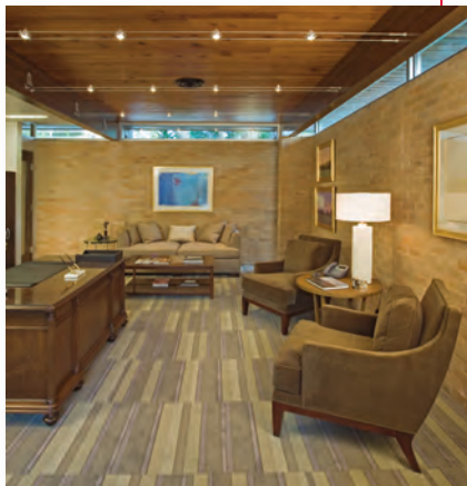
New Regional Planning