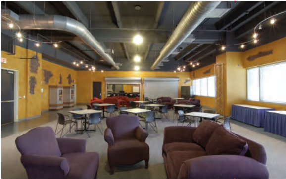
Lakewood Church Teen Room