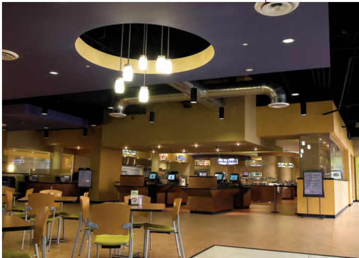
Baylor College of Medicine Dining Facility

“They think out of the box , they act fast and have a sense of urgency . They gave us a different look on budget and on a tight time schedule .”