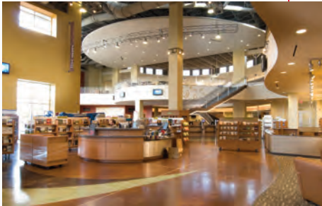
Fellowship of The Woodlands Café and Bookstore