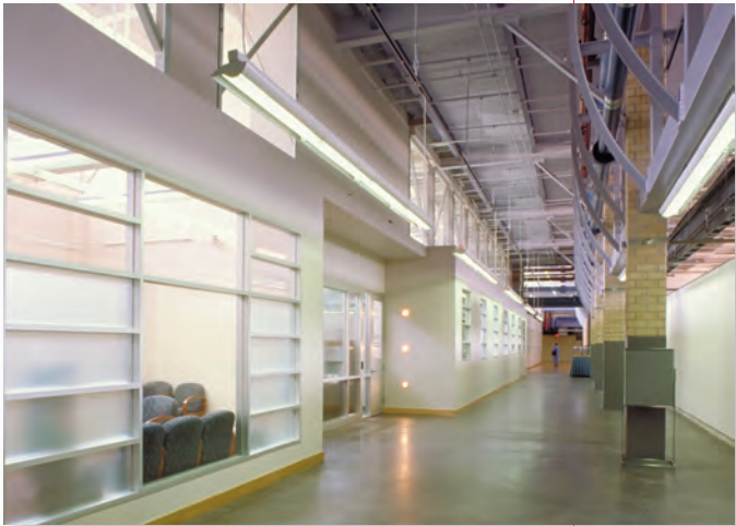
John P. McGovern Campus, Main Street