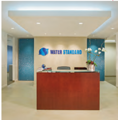
Water Standard Company