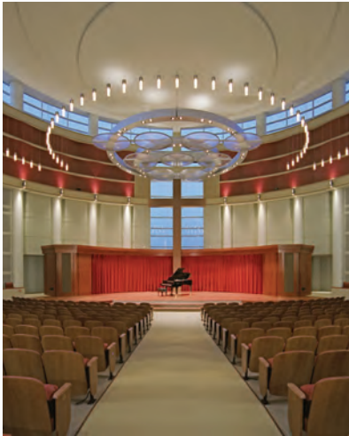
Houston Baptist University Chapel